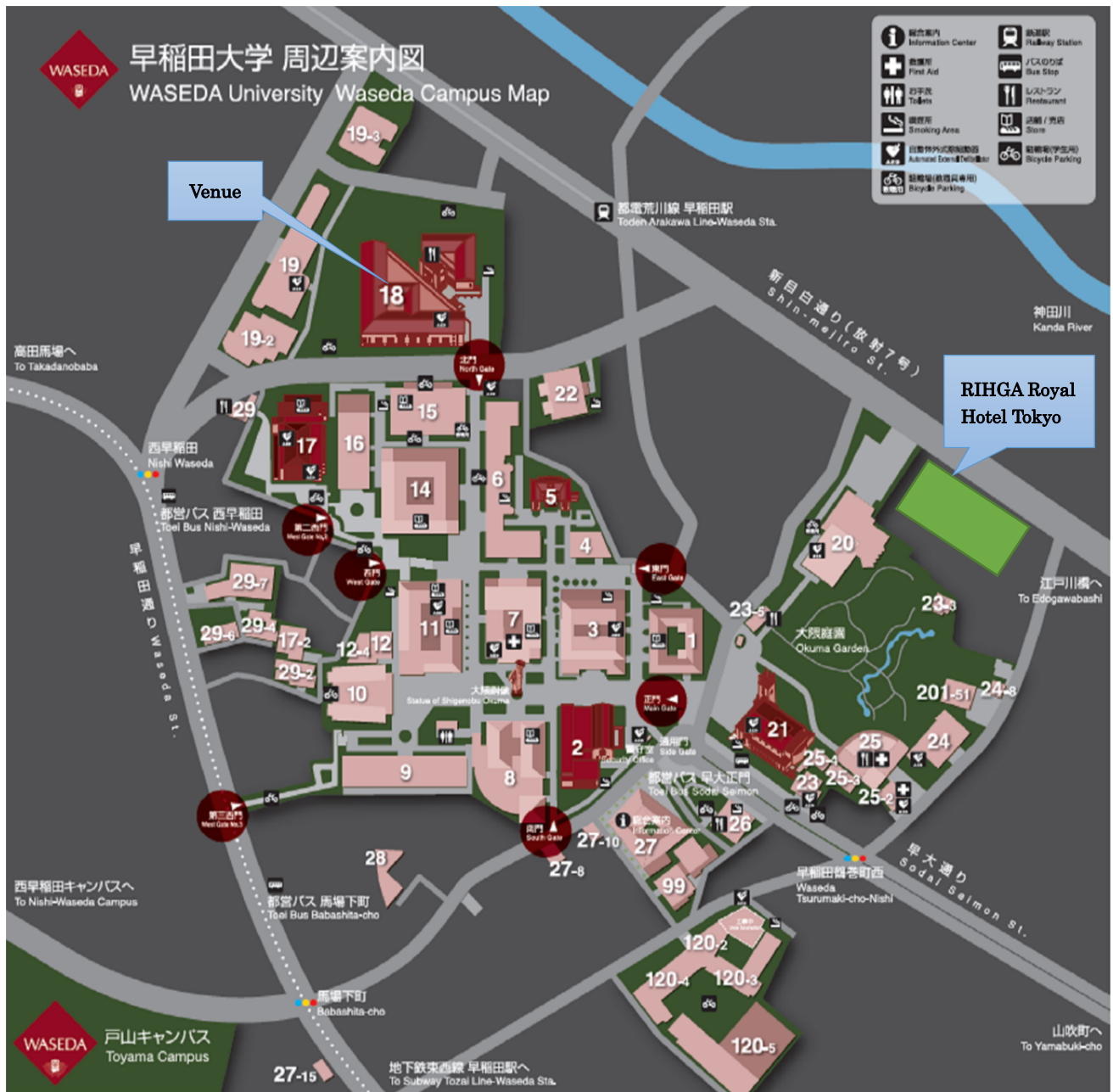
International Conference Center indicated by 18 in the campus map of Waseda University